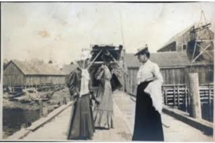
"Seeing the Newly Weds off 1907," Round Pond