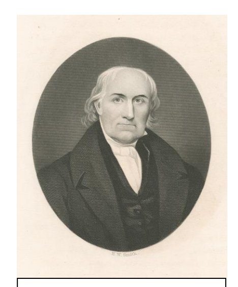
Commodore Samuel Tucker

Samuel Tucker was a naval hero of both the Revolutionary War and the War of 1812. Born in Marblehead, MA in 1747, his long and eventful life ended in Old Bristol (now Bremen) at the age of 86 where he lies buried in the lower portion of the Old Bremen Cemetery. A monument to his memory was erected at his gravesite by the State of Maine and can be seen from Route 32 approximately 1/2 mile north of the town of Bremen.